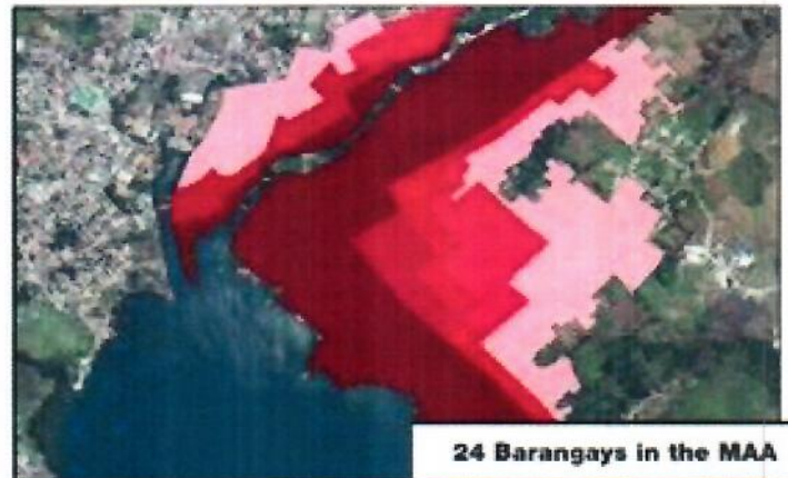
24 Barangays in the MAA